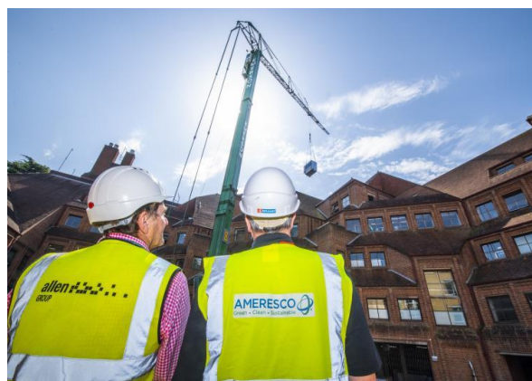
Figure 7 - Hillingdon Civic Centre Decarbonisation Project