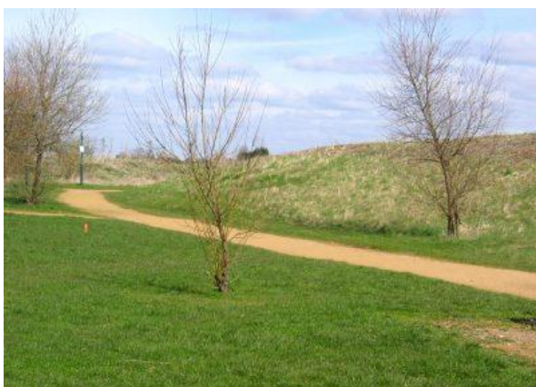
Figure 6 – Minet Country Park Improvements