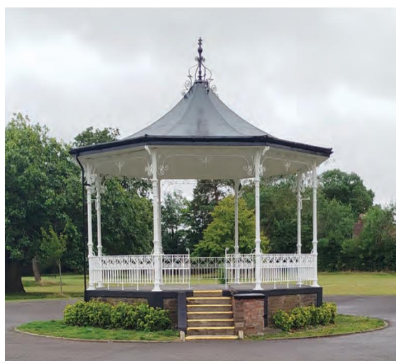
Figure 4 - Refurbished bandstand at Barra Hall Park example of project formerly undertaken by the Chrysalis

2.20 Neighbourhood CIL funded schemes across the borough are currently delivered through the Chrysalis Programme - local bids are submitted and reviewed to ensure that they meet the funding criteria. In 2024/25, £110,457.76 of NCIL collected was spent on the local schemes in the Chrysalis Programme. Please see Appendix 2 for a full breakdown of schemes funded by the Chrysalis Programme. It is important to note that the Chrysalis Programme is not