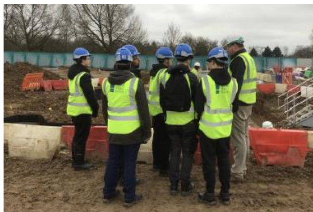
Figure 6 – Students from Uxbridge college visiting the Harlington School construction site.

3.21 These measures play a vital role in ensuring that development is sustainable, inclusive, and aligned with local priorities.