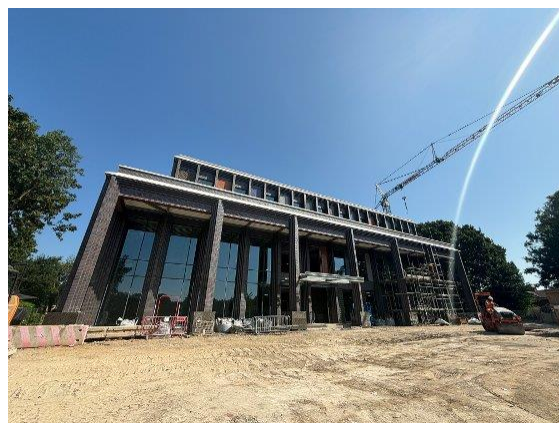
Figure 3 - The Platinum Jubilee Leisure Centre under construction.

2.17 The strategic portion of Hillingdon's CIL expenditure is currently put towards the delivery of the Platinum Jubilee Leisure Centre, a major infrastructure project being delivered through the Council's Capital Programme. This programme forms part of the Council's Medium-Term Financial Forecast (MTFF), which is approved by Cabinet and outlines capital expenditure, financing, and receipts over a five-year period.