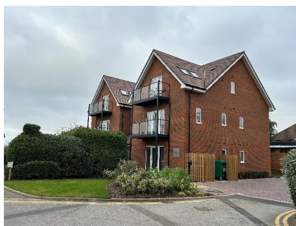
Figure 2 – The Blackmore Way site in Uxbridge

2.12 The full list of developments that provided a HCIL receipt in 2024/25 are detailed in Appendix 1. The largest payments were received from the Northwood Commercial Sales/Autocentre redevelopment on Pinner Road, contributing £99,574.43, and 27 Dene Road in Northwood, which contributed £88,741.30. Other notable schemes included the land adjacent to Whiteheath Junior School in Ruislip (£48,909.06), residential development at 5 & 6 Firs Walk in Northwood (£36,083.90) and the Blackmore Way site in Uxbridge (£30,391.58). These developments consist of small and medium scale residential buildings and this is reflected in the smaller overall total received compared to previous financial years.