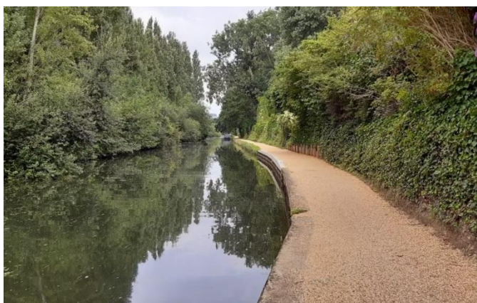
Figure 5 – Grand Union Canal Towpath Improvements